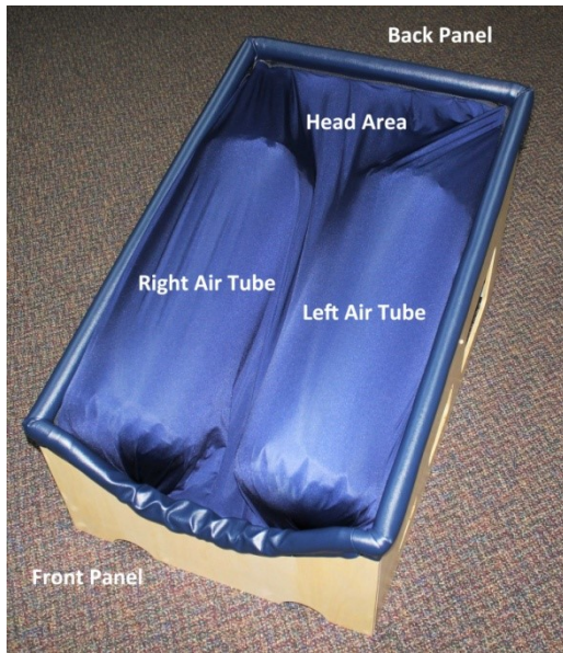
Figure 1: Sensory Lounger

The main parts of the Sensory Lounger are shown in figures 1 and 2: