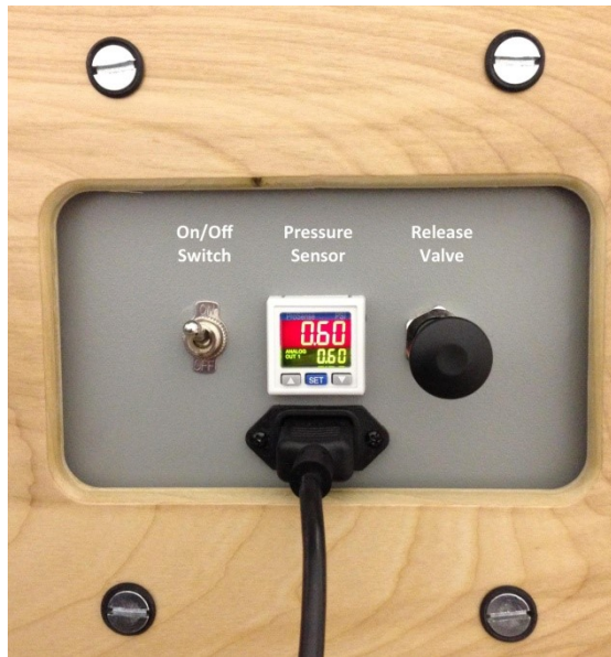
Figure 2: Control Box